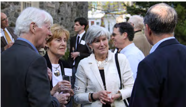
Supporters enjoying beverages al fresco .